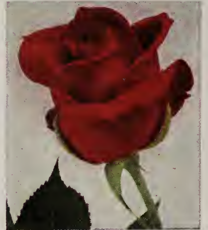
Etoile de Hollande

SPECIAL OFFER The above six New and Rare Roses, $4.75 value for . . . $4.25 Six choice Hardy Roses pictured below, $3.00 value for . . . $2.65